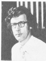
PETER HURFORD March 8 8:00 p.m. — Master of the Music at the Cathedral and Abbey Church of Saint Alban in England. Founder