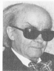
JEAN LANGLAIS April 23 4:00 p.m. — Organist at Ste. Clotilde in Paris. First Prize Paris Conservatoire; Doctor of Music,

and Artistic Director of the Inter-nations Organ Festival. Studied music at the Royal College of Music and Cambridge University. Has recorded eighteen albums, has played to excellent reviews world-wide. Termed "the best Bach player in England and one of the best anywhere." Believes that "the organ is capable of as much finesse as the violin" and displays this in his performances.